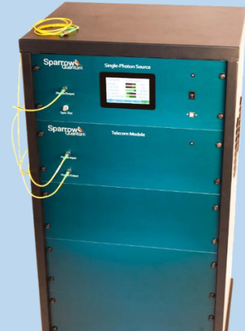
Integrated Telecom source 1550 nm