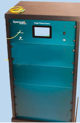
Integrated source 950 nm