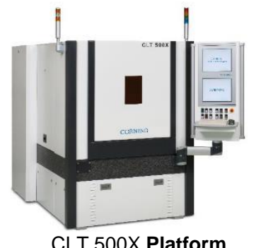
CLT 500X Platform